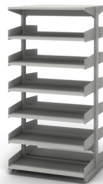
Freestanding - Double